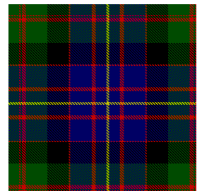
Basic Cameron Hunting Cameron Cameron of Lochiel Cameron of Erracht

CREST: Five arrows 'united' with one another with a gules (red) ribbon or band